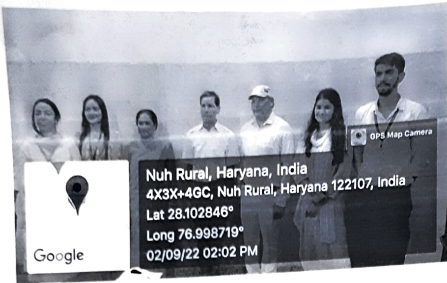
Photo 5 Staff members with faculties and members