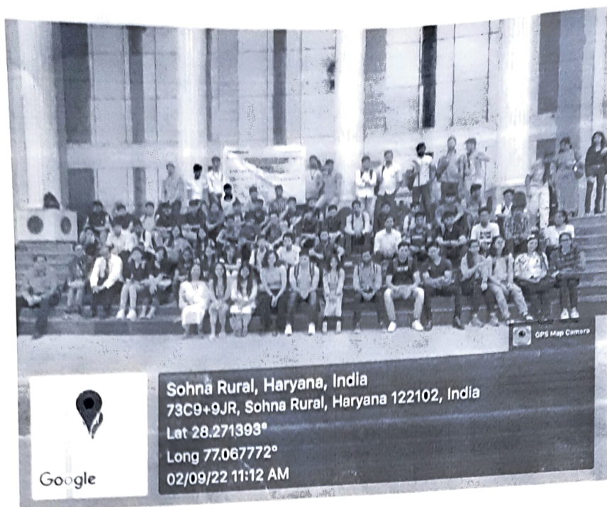
Photo-1 Students, faculties and Dean of SOMC