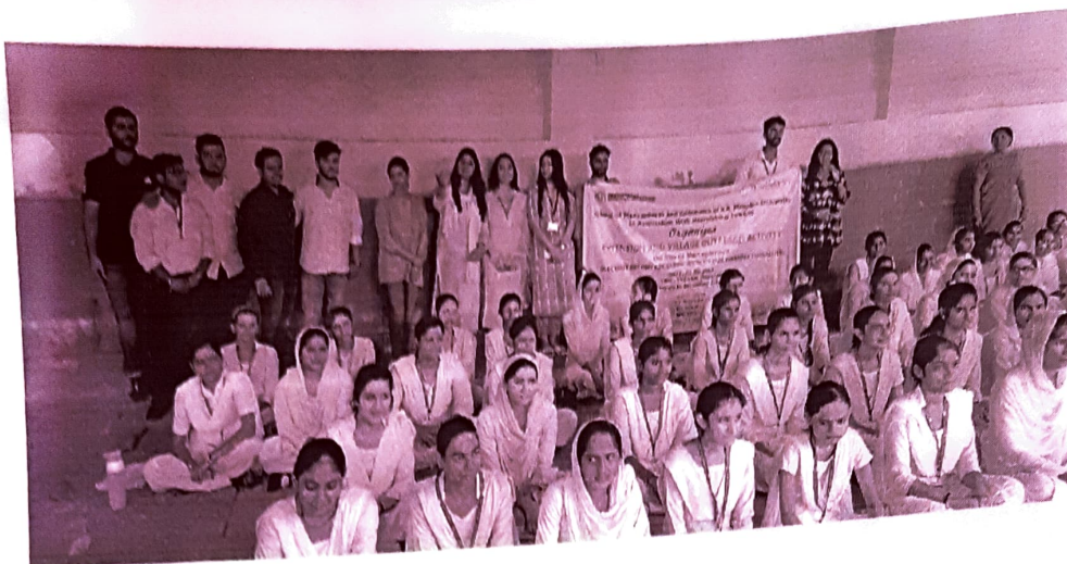
Photo-3 Group photo with students post activity